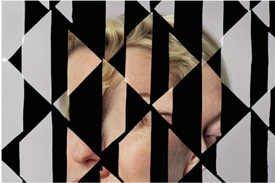
Hannah Whitaker: (Untitled) Blue Shirt