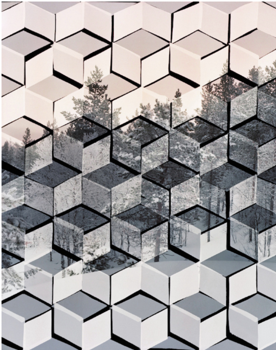
Hannah Whitaker: Arctic Landscape (Pink Sky)